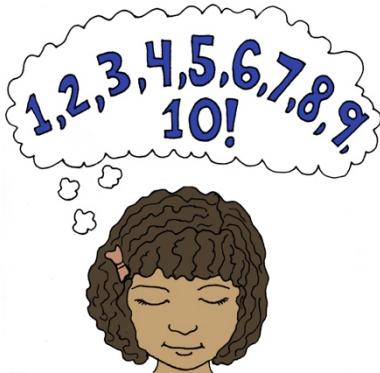
Count to Ten