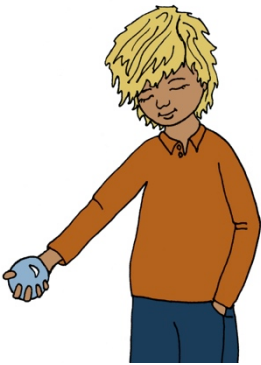
Squeeze a Ball